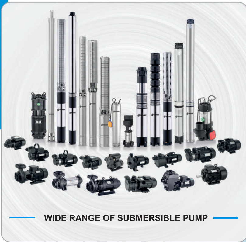
WIDE RANGE OF SUBMERSIBLE PUMP